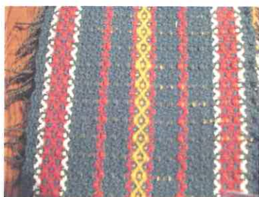
The backing of the Protection rya, in the manner of the Vesterheim rya.

I used this backing for a rya wallhanging. It was inspired by the protective symbols painted in white on the dark walls of a medieval house in the Hardanger Museum. I made my knots in blacks and dark grays and browns and in white and off white shades. I liked the green, red, white and gold of the Vesterheim rya so much that I retained those colors in my backing. The brighter warp knots give a nice contrast to the neutrals of the other knots the colored threads need to match the right spot in the draft.