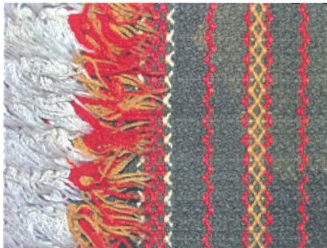
Detail of Vesterheim rya.

The warp sett is 22 epi and the weft is about 16 ppi.