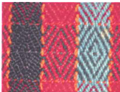
Close-ups of the Vesterheim goose eye rya

Rows are knotted at the edge of the block on the orange row for two rows and then switch